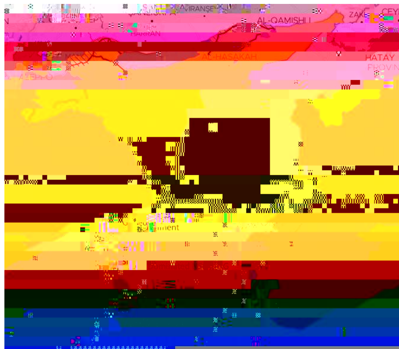
Figure 1: Dominant actors' area of control and influence in Syria as of 26 January 2020. NSOAG stands for Non-state Organized Armed Groups. Also, please see the footnote on page 2.