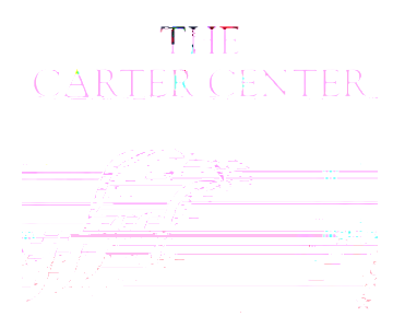
Weekly Conflict Summary